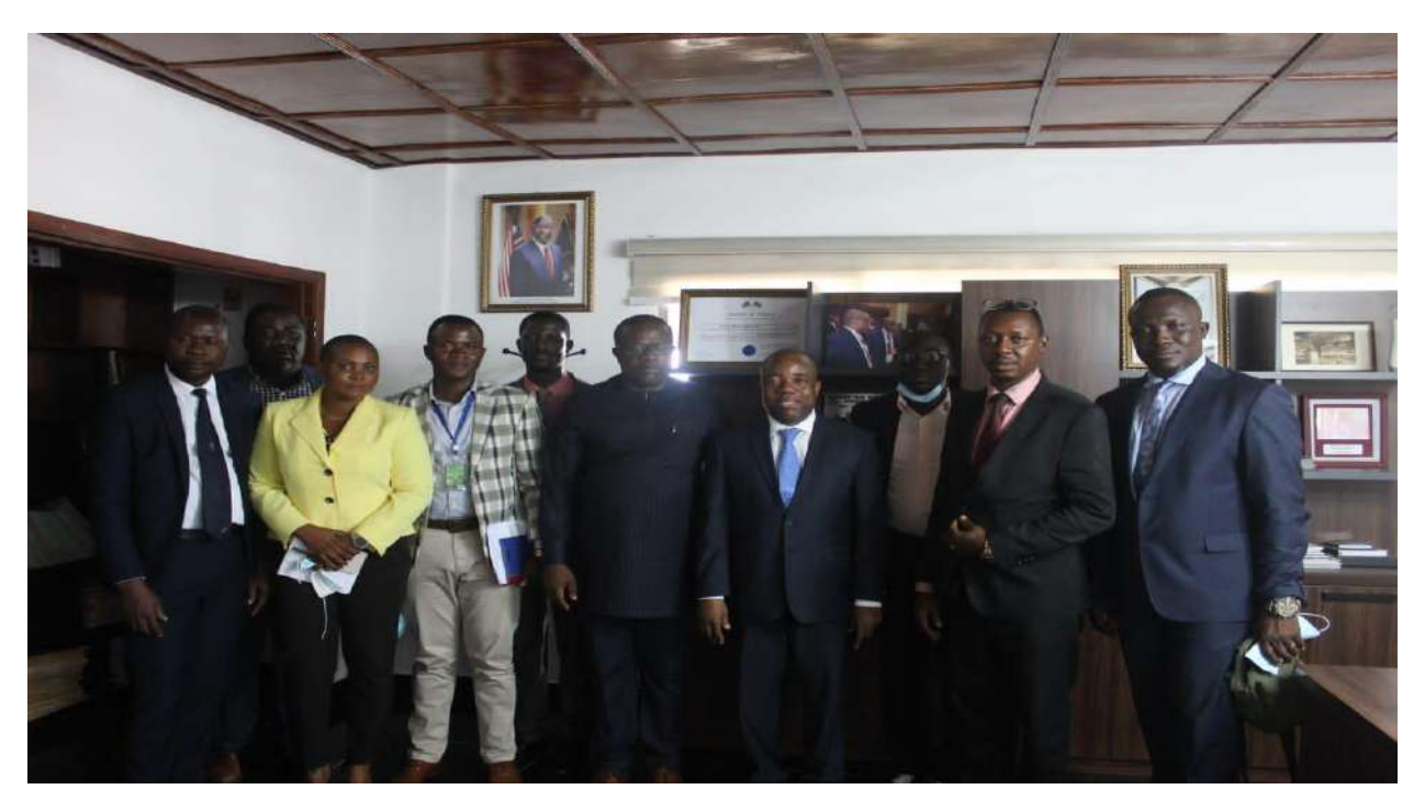
Delegation from Sierra Leone and the Liberian FIU together with the Attorney General and Minister of Justice

With a successful completion of day one's activities, day two of the mentorship program started with a meeting with the Immigration. That meeting was followed by a meeting with the Commissioner of Liberian Anti-Corruption Commission, Liberian Drug Enforcement Agency respectively.