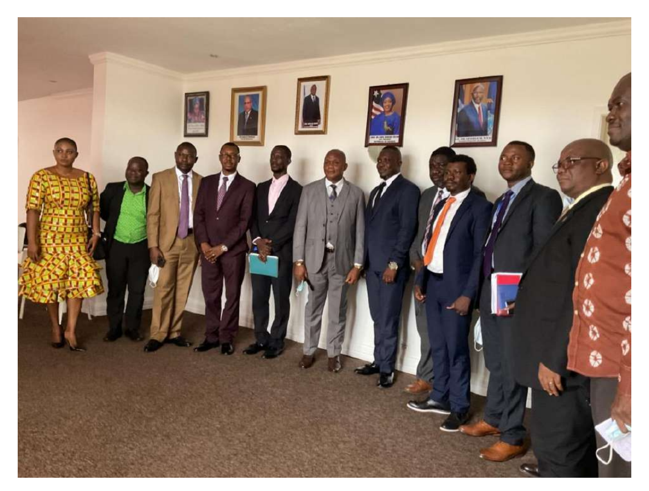
Delegation from Sierra Leone and cross section of the Liberia FIU together with members from the Liberia Anti-corruption

The Chairman confessed inconsistency in their laws as a key challenge; especially those relating to confiscation. He informed his audience that the LACC does not have a prosecutorial power like the ACC of Sierra Leone.