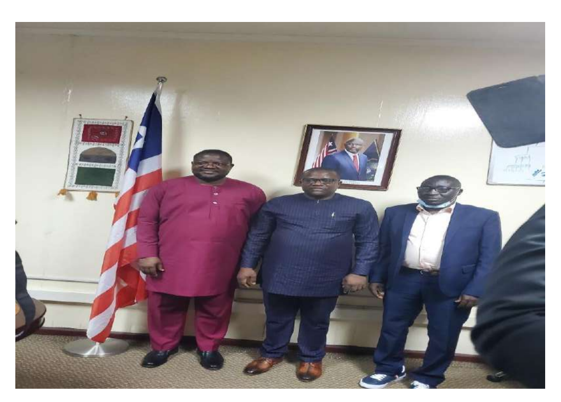
The Liberian deputy Minister of Finance, Director FIUSL and Director General LFIU

The Deputy Minister in his response thanked the team for the visit and collaboration and knowledge sharing experience. He told the team that his Minister has been very supportive of the work of the LFIU. On issues around political will, the minister said there is huge political will in supporting the LFIU. According to him, the president has even given directives on the ratification of the two laws. They do not want to be part of terrorist financing. With respect to resources, he expressed the unavailability of resource as they are scarce but, in every instance, they have been committed to take LFIU to higher height. He finally spoke on issues relating to staffing right, training and effective coordination. He finally assured the team of government commitments to support the work of LFIU.