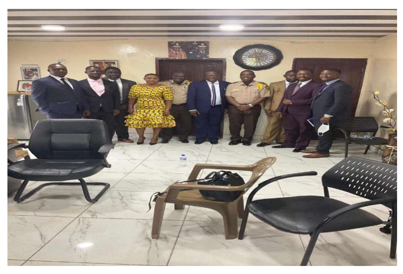
Cross section of the LFIU and the Sierra Leone delegation meet with the Commissioners of Immigration in Liberia