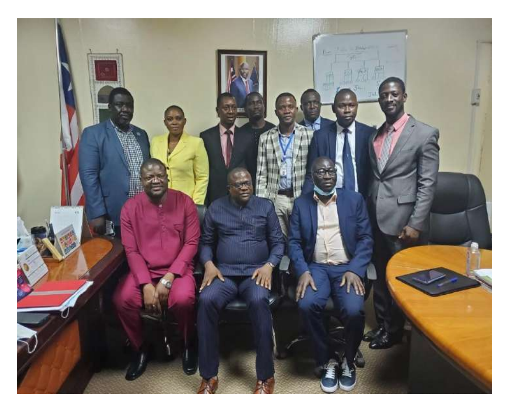
Delegation from Sierra Leone and cross section of the Liberian FIU together with the Deputy Minister of Finance in Liberia