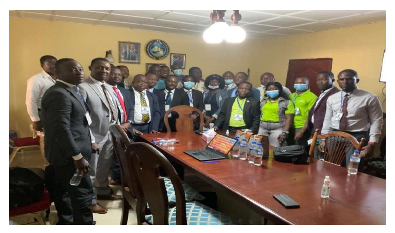
Sierra Leone Delegation and the Liberia FIU meet with the Commercial banks and other Financial Institutions in Liberia