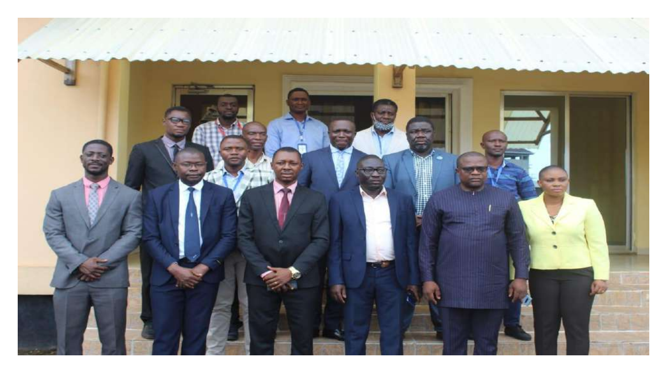
Cross section of the Liberian FIU and the delegation from Sierra Leone at the FIU's Office in Liberia

in the risk assessment at various MDA level. The training of a risk assessor is key as well as understanding the methodology employed in the risk assessment.