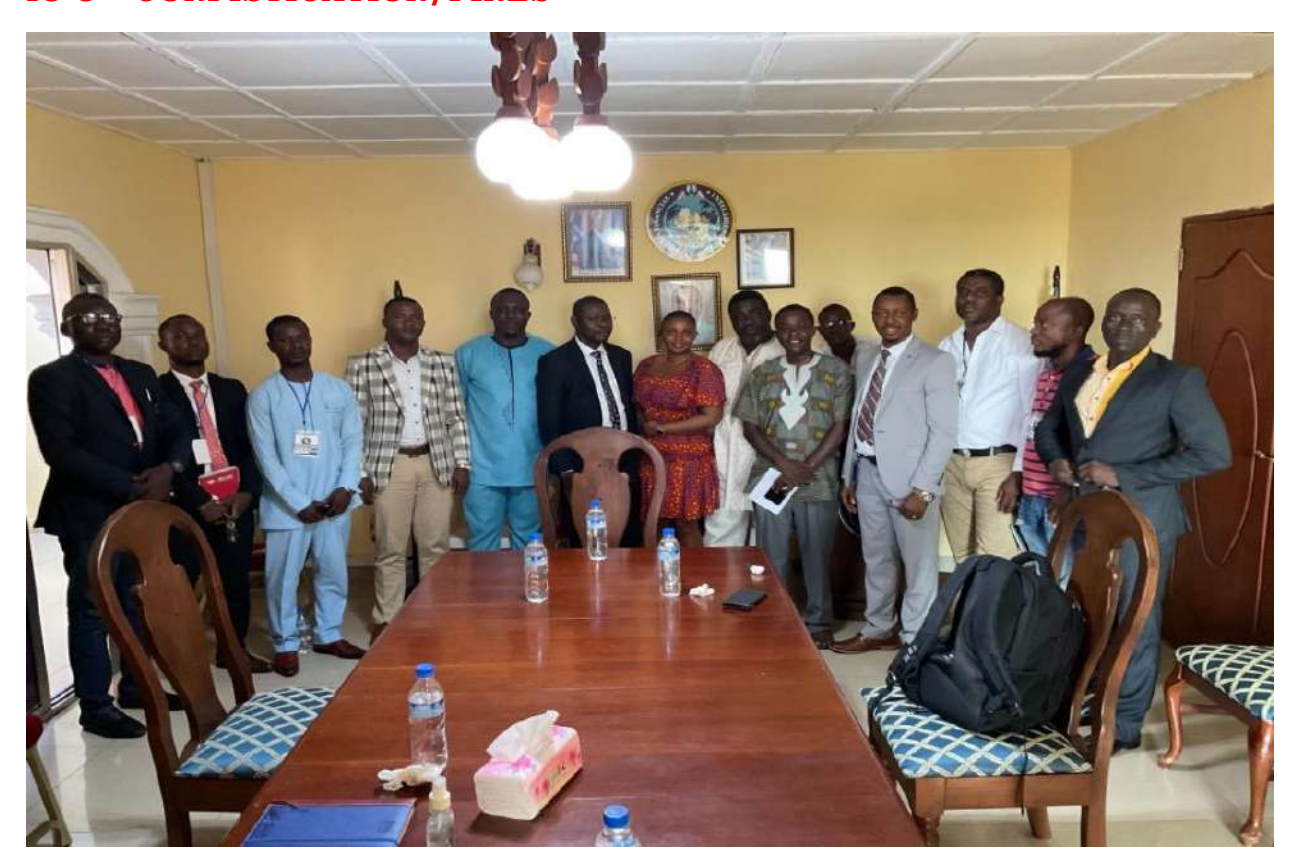
The Liberian FIU and the Sierra Leone Delegation meet with the insurance companies in Liberia