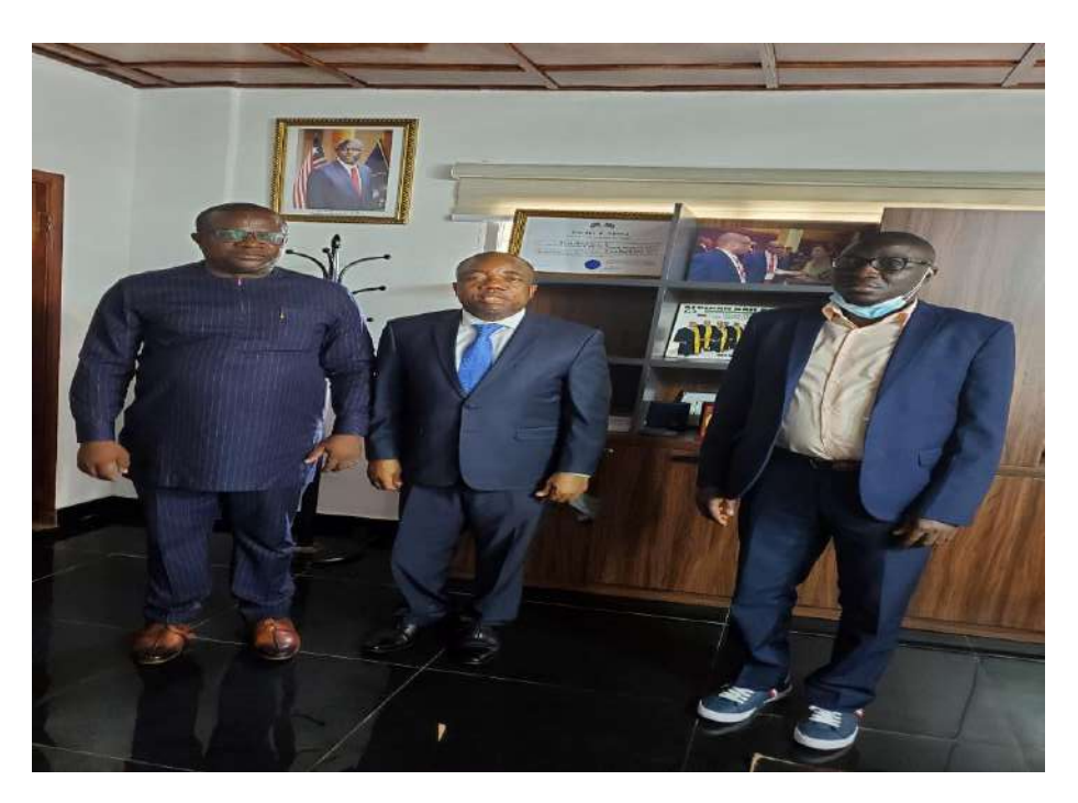
Director SL FIU, Attorney General and Minister of Justice and the Director General of LFIU

Responding to the statement made by the Director of SLFIU, the minister thanked the delegation and informed them that Sierra Leone and Liberia have similar features and therefore we continue to collaborate. He spoke about the inconsistency in the existing laws, but he assured the delegation of government commitment.