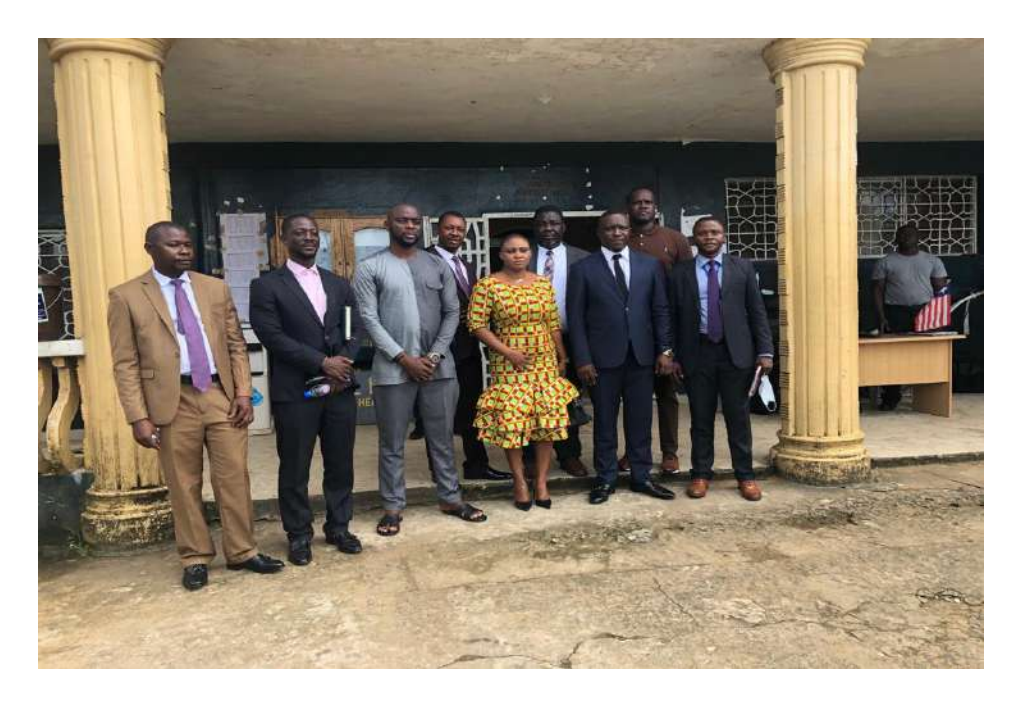
Delegation from Sierra Leone and cross section of the LFIU meets with the Director of LDEA

Day three of the mentorship program started with a meeting with the management of the National Security Agency of Liberia. That meeting was followed by a meeting with the Liberian Business Registry and Liberia National Police respectively.